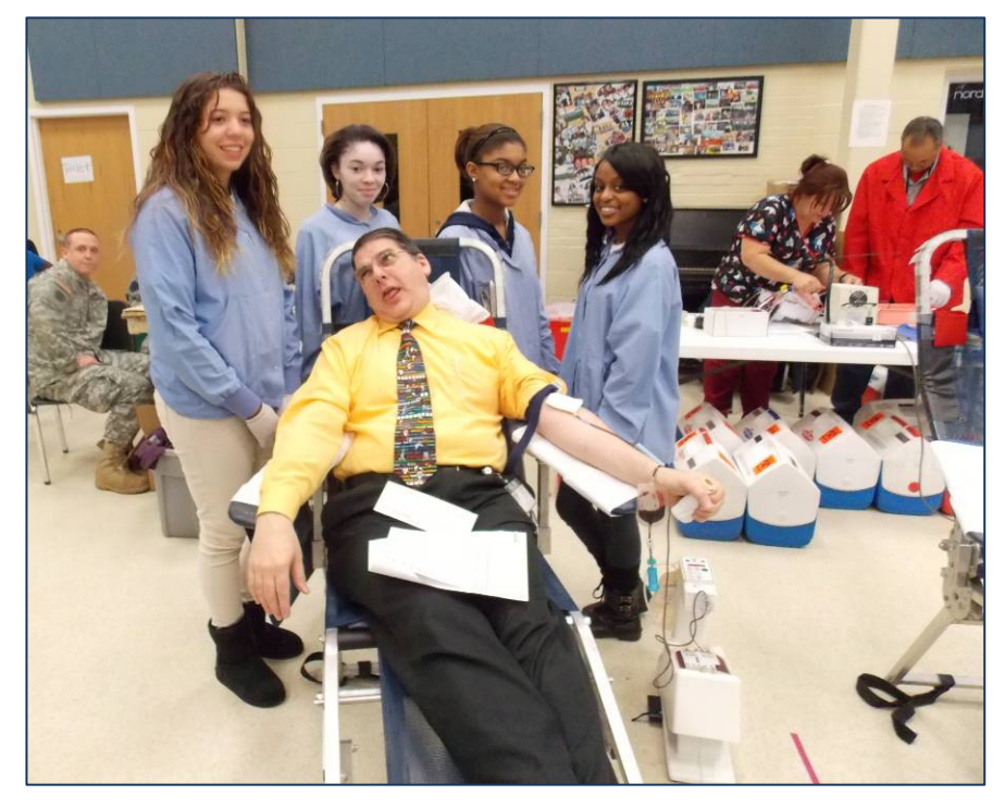
The Student Government and HOSA organizations sponsored the annual Winter Blood Drive and collected 63 pints of blood which helped save over 190 lives.